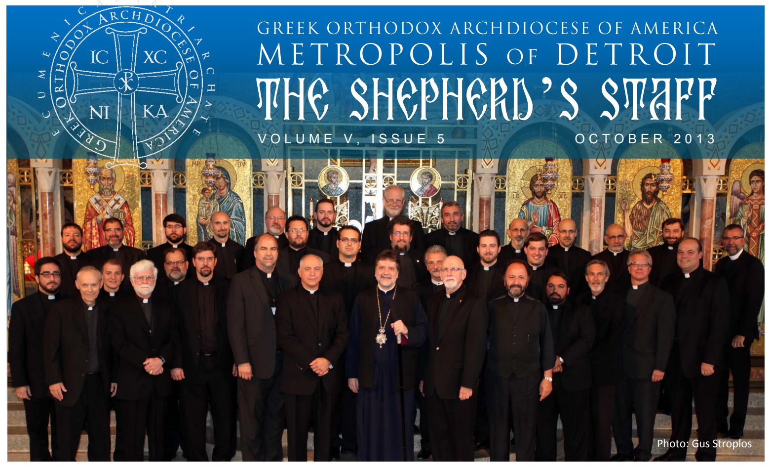
Photo: Metropolitan Nicholas with clergy of the Metropolis attending the Clergy-Laity Conference in Cincinnati, Ohio.