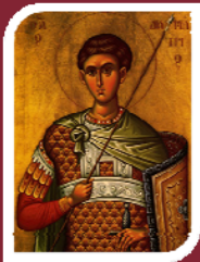
ST. DEMETRIOS THE MYRRHBEARER OCTOBER 26

THIS IS MY COMMANDMENT, THAT YOU LOVE ONE ANOTHER AS I HAVE LOVED YOU. GREATER LOVE HAS NO MAN THAN THIS, THAT A MAN LAY DOWN HIS LIFE FOR HIS FRIENDS. YOU ARE MY FRIENDS IF YOU DO WHAT I COMMAND YOU. NO LONGER DO I CALL YOU SERVANTS, FOR THE SERVANT DOES NOT KNOW WHAT HIS MASTER IS DOING; BUT I HAVE CALLED YOU FRIENDS, FOR ALL THAT I HAVE HEARD FROM MY FATHER I HAVE MADE KNOWN TO YOU.