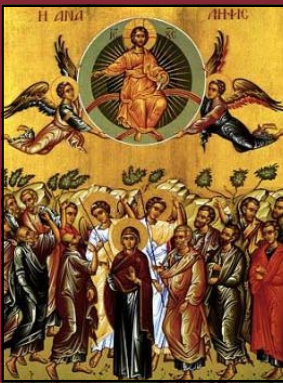
ASCENSION OF THE LORD