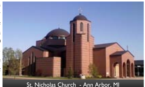
St. Nicholas Church - Ann Arbor, MI