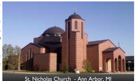
St. Nicholas Church - Ann Arbor, MI