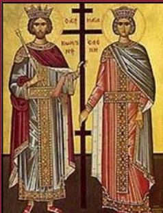
STS. CONSTANTINE AND HELEN

www.youtube.com/user/metropolisofdetroit