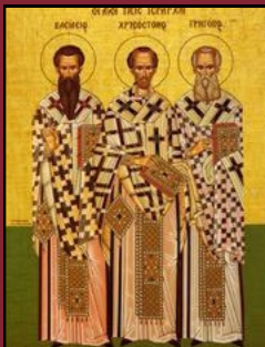
Synaxis of the Three Hierarchs

www.youtube.com/user/metropolisofdetroit