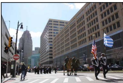
The Sunday Parade started at 3pm on Monroe/ Woodward Streets with dignitaries and a police escort leading the march.