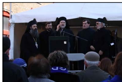
Metropolitan Nicholas and clergy sing the Kontakion "Te Ypermahō" as His Eminence blesses the beginning of the ceremony from the dignitaries' stage mounted at Monroe/ Beaubien Streets.