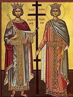
ST. CONSTANTINE AND HELEN

www.youtube.com/user/metropolisofdetroit