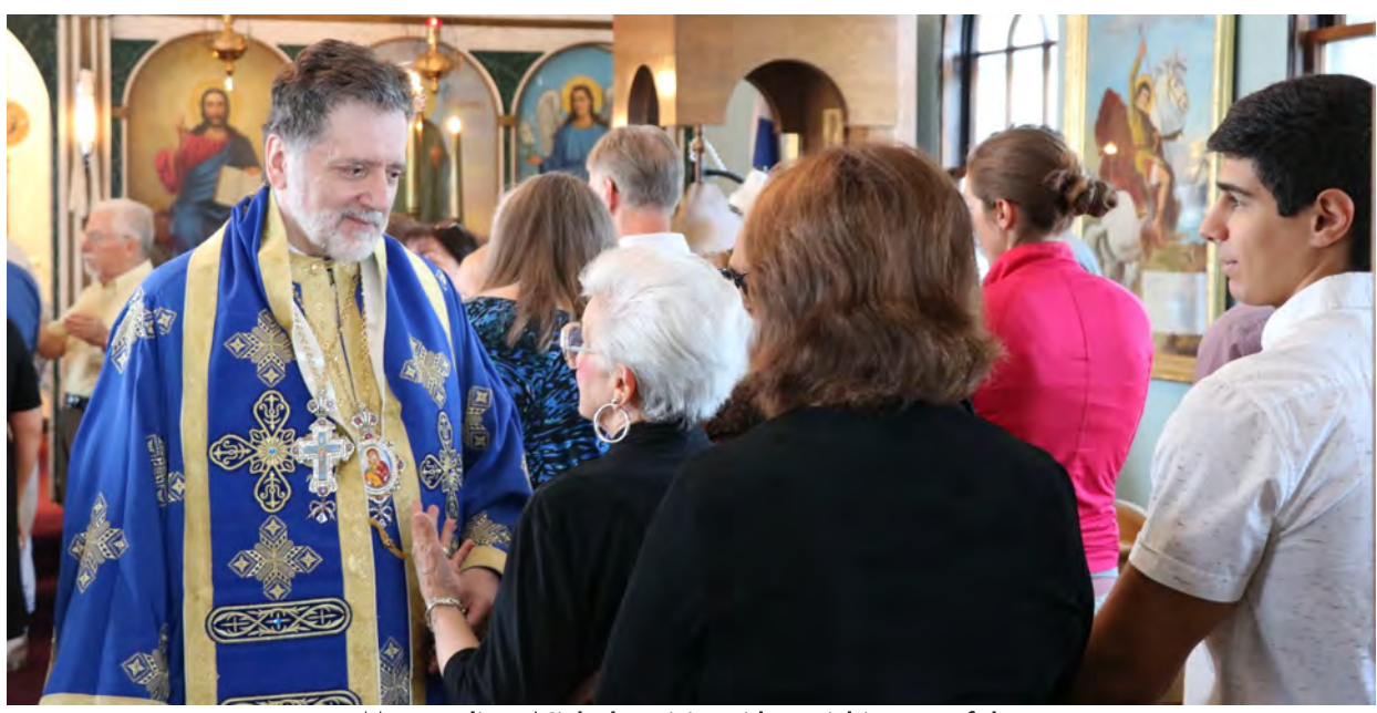
Metropolitan Nicholas visits with parishioners of the Assumption Church in Marquette, Michigan for their parish feast day.