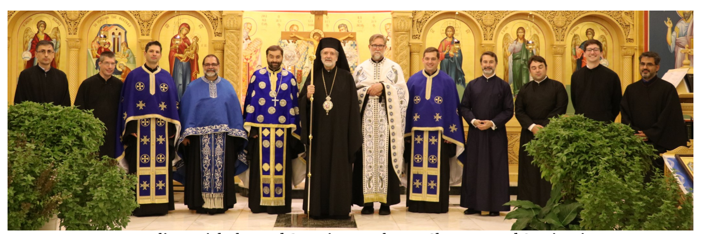
Metropolitan Nicholas and Detroit area clergy, Chanters and Seminarians at Vespers for the Feast of the Nativity of the Theotokos. Nativity of the Theotokos, Monday, September 8, 2020