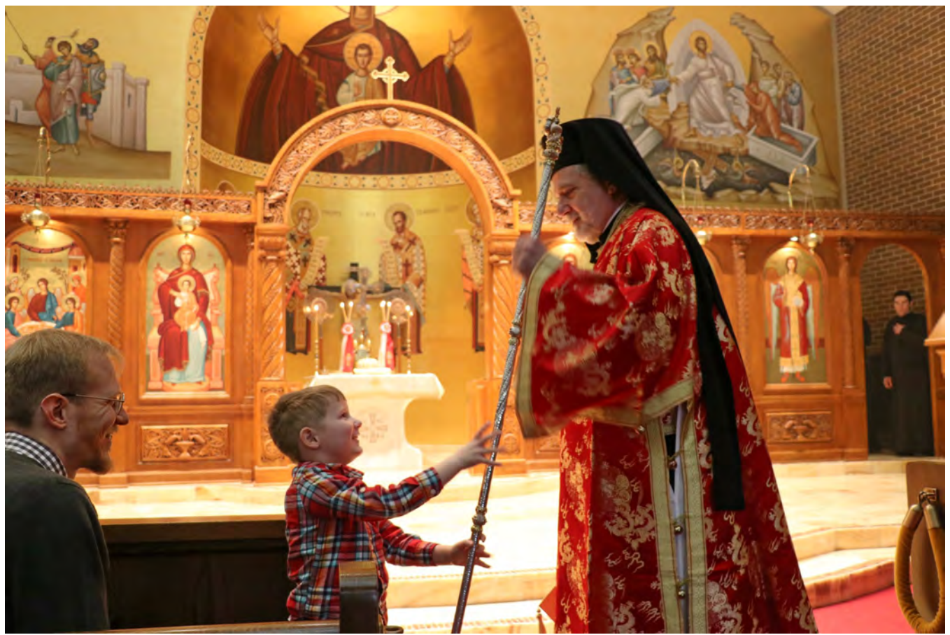
Photo: His Eminence Serves the Divine Liturgy during GOYO Weekend January 28, 2018 | Holy Trinity Church, Grand Rapids, MI