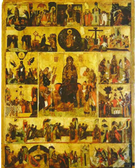
Icon of the Most-Holy Theotokos and Christ, surrounded by scenes from the Akathist.

We hope this brief explanation of changes to expect in our upcoming services for Great Lent is helpful to understanding the work of church musicians and, most importantly, that your worship experience is enhanced. We wish you a productive and meaningful journey through Great Lent!