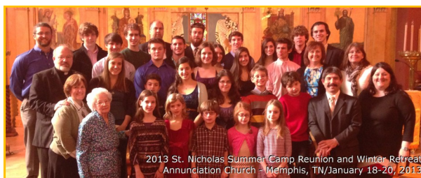
2013 St. Nicholas Summer Camp Reunion and Winter Retreat Annunciation Church - Memphis, TN/January 18-20, 2013