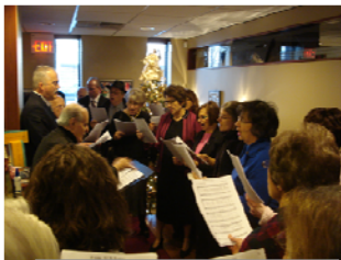
Metropolis' Choir caroling guests at the St. Nicholas Open House on December 6, 2009