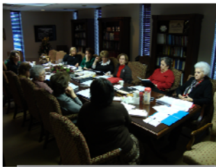
Metropolis of Detroit Philoptochos Board Meeting December 11, 2009