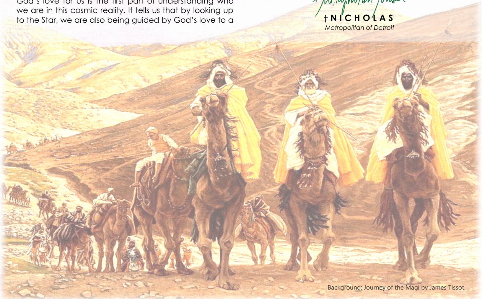
Background: Journey of the Magi by James Tissot.