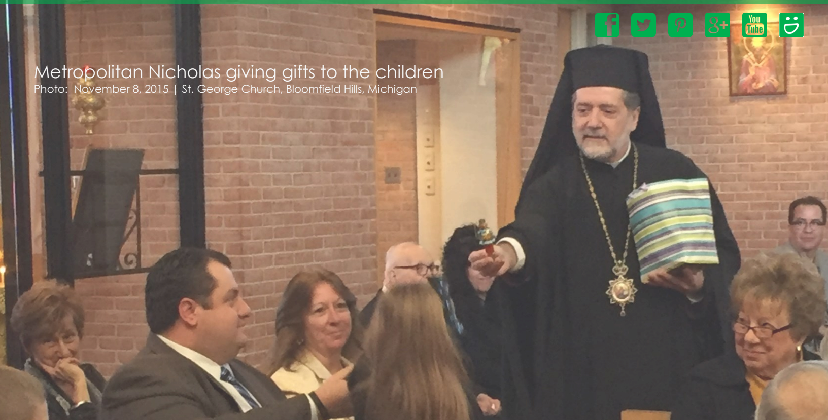
Photo: November 8, 2015 | St. George Church, Bloomfield Hills, Michigan