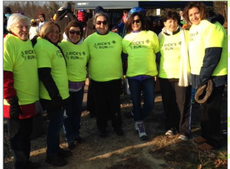
St. Nicholas Philoptochos volunteers at the 5k Run for Rick's Kids.

As we celebrate the Nativity of our Lord, we wish everyone a blessed holiday season and a happy and healthy 2015. Our first event of the New Year will be the Vasilopita celebrations throughout the Metropolis.