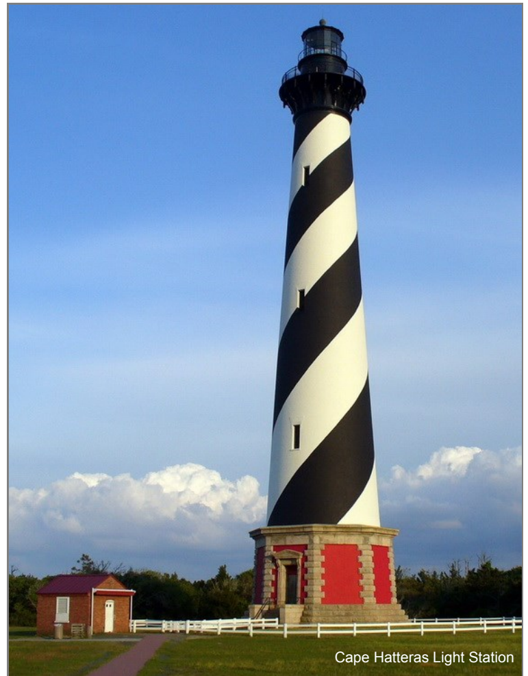
Cape Hatteras Light Station

"You are the light of the world," providing clarity and Truth to a confused society. Thousands of ships have