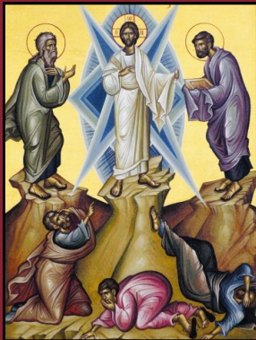
TRANSFIGURATION OF OUR LORD JESUS CHRIST