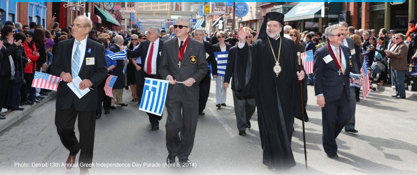
Photo: Detroit 13th Annual Greek Independence Day Parade (April 6, 2014)