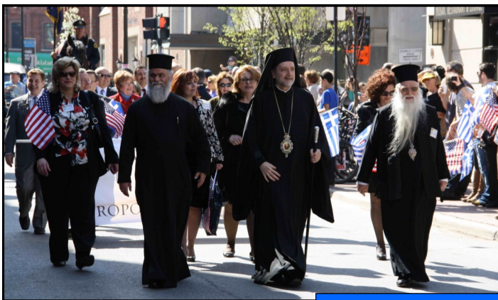
11 th Annual Detroit Greek Independence Day Parade - Detroit, MI