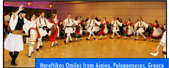
Horeftikos Omilos from Aigiou, Peloponnesos, Greece