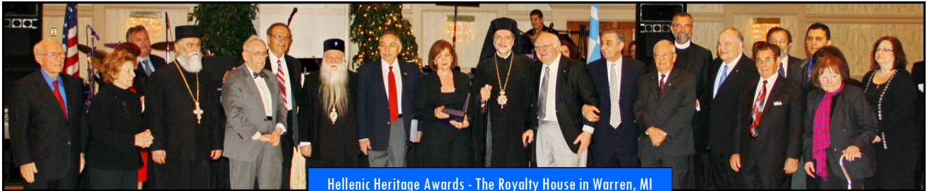
Hellenic Heritage Awards - The Royalty House in Warren, MI