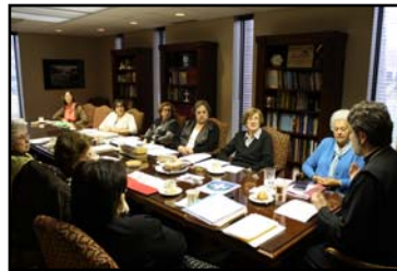
Metropolis Philoptochos Meeting, March 12

Each month Philoptochos chapters designate philanthropic charities to support. They expand their projects to include the entire parish. In this way, everyone becomes a part of the Philoptochos mission. Please assist the Philoptochos women in your parish to assist those less fortunate either within the parish or for outreach philanthropy.