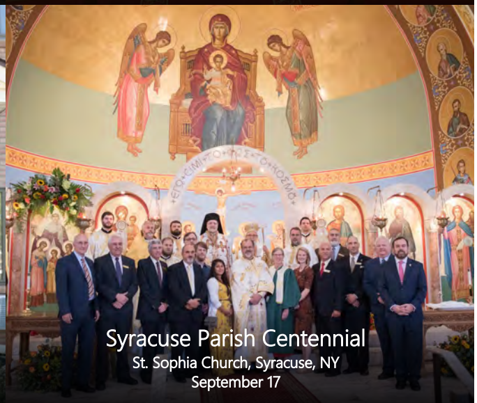
Syracuse Parish Centennial St. Sophia Church, Syracuse, NY September 17