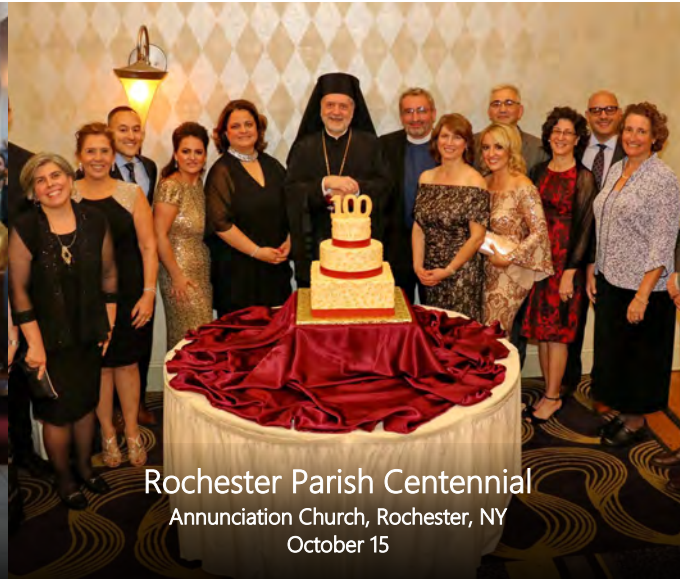
Rochester Parish Centennial Annunciation Church, Rochester, NY October 15