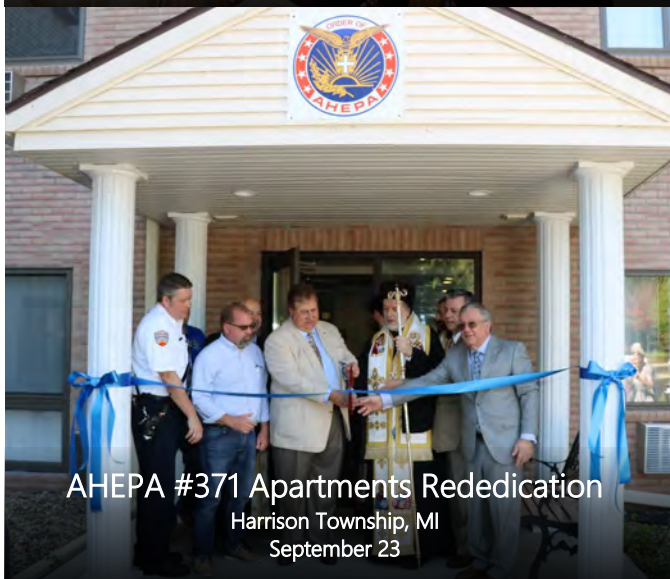
AHEPA #371 Apartments Rededication Harrison Township, MI September 23