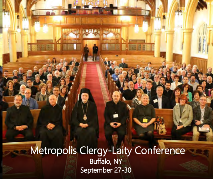
Metropolis Clergy-Laity Conference Buffalo, NY September 27-30