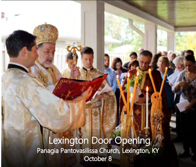
Lexington Door Opening Panagia Pantovasilissa Church, Lexington, KY October 8