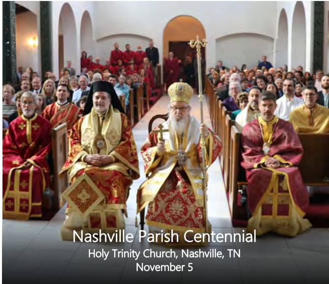
Nashville Parish Centennial Holy Trinity Church, Nashville, TN November 5