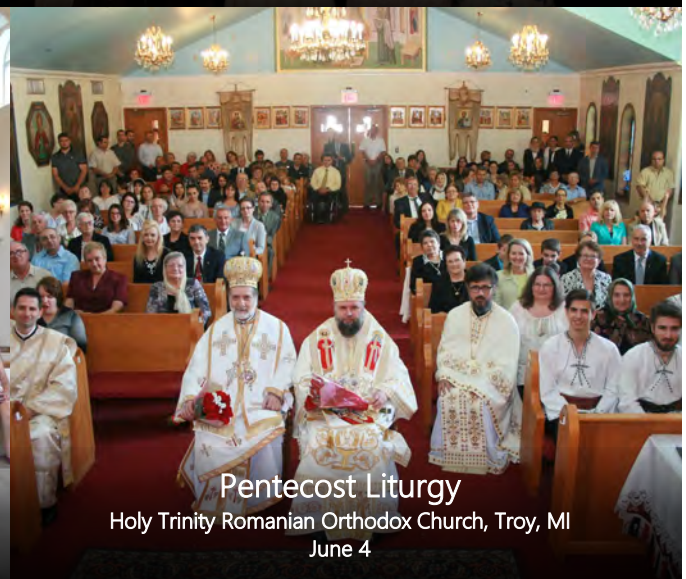
Pentecost Liturgy Holy Trinity Romanian Orthodox Church, Troy, MI June 4