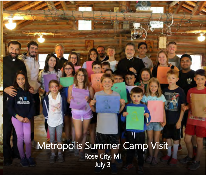
Metropolis Summer Camp Visit Rose City, MI July 3