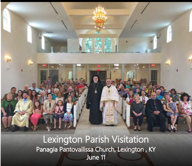
Lexington Parish Visitation Panagia Pantovailissa Church, Lexington, KY June 11