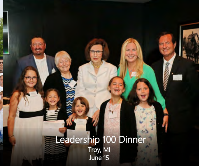
Leadership 100 Dinner Troy, MI June 15