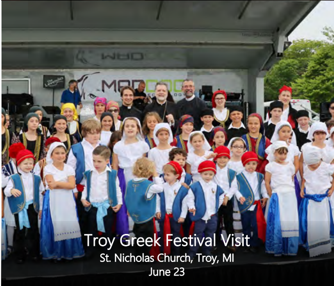
Troy Greek Festival Visit St. Nicholas Church, Troy, MI June 23