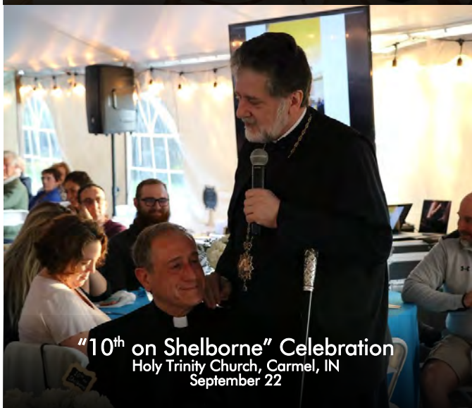
"10 th on Shelborne" Celebration Holy Trinity Church, Carmel, IN September 22