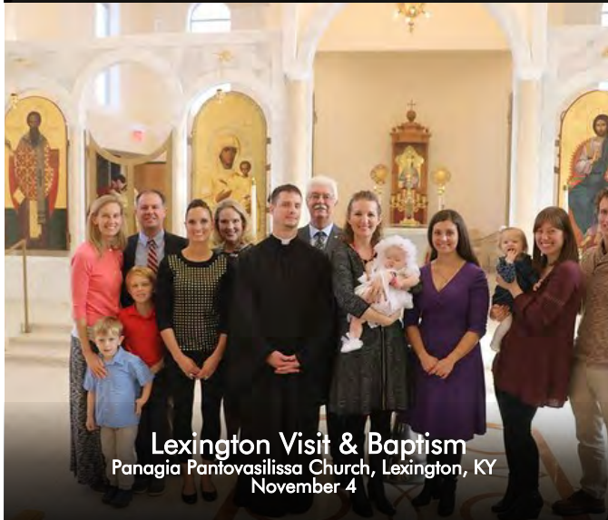
Lexington Visit & Baptism Panagia Pantovasilissa Church, Lexington, KY November 4