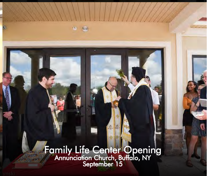
Family Life Center Opening Annunciation Church, Buffalo, NY September 15