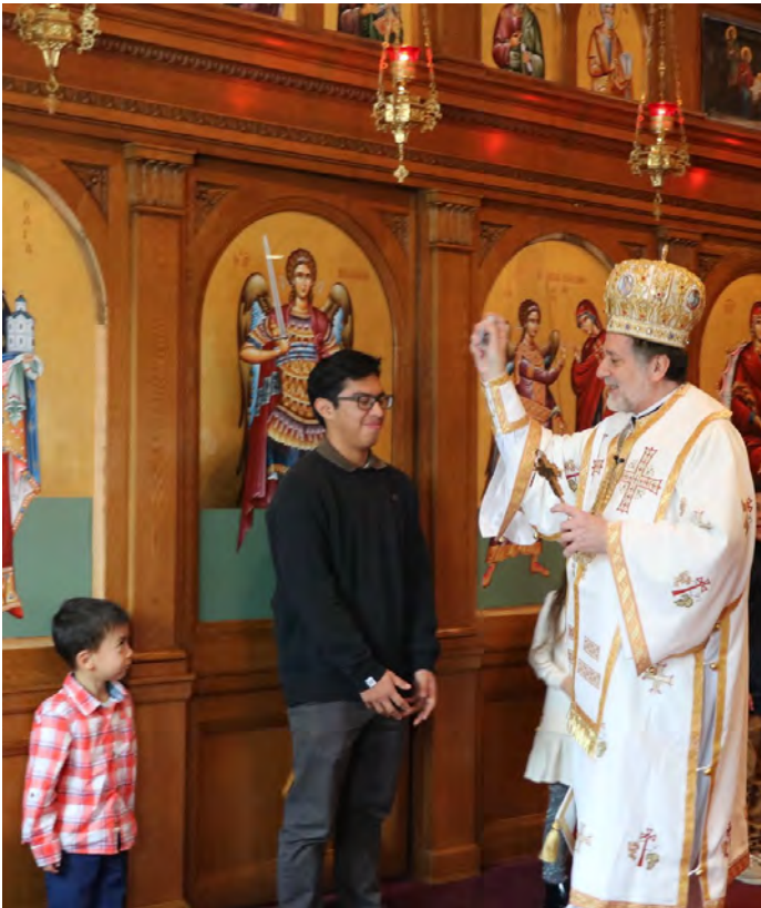
His Eminence blesses the Annunciation Muskegon parish community upon completion of the first phase of their new iconography project.

From earliest childhood these signs of Christmas carried great meaning for us. We all remember how our parents began decorating the house with lights around the windows, garlands across the mantle, and the special place set aside for the tree. We began seeing