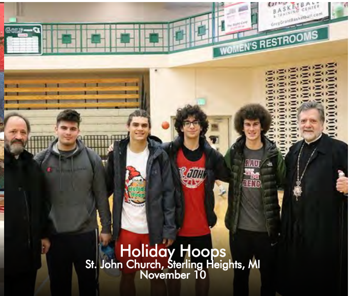
Holiday Hoops St. John Church, Sterling Heights, MI November 10