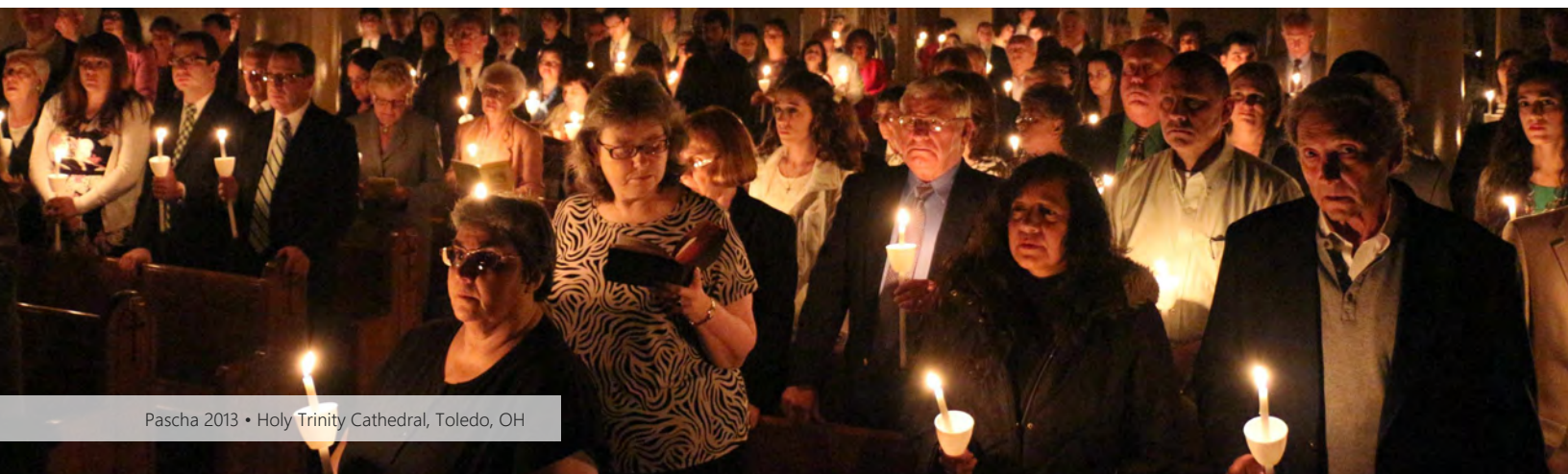
Pascha 2013 • Holy Trinity Cathedral, Toledo, OH