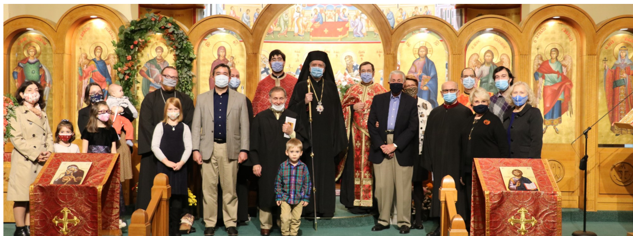
Metropolitan Nicholas at Vespers for the Feast of the St. Demetrios. Nativity of the Theotokos, Monday, September 8, 2020