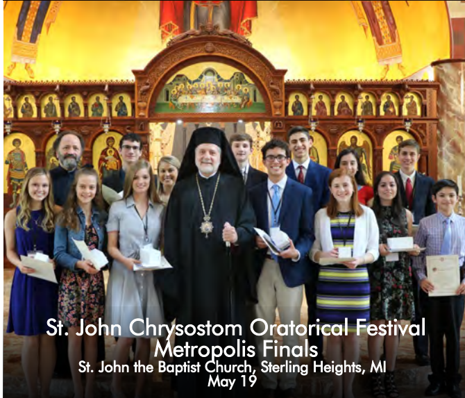
St. John Chrysostom Oratorical Festival Metropolis Finals St. John the Baptist Church, Sterling Heights, MI May 19