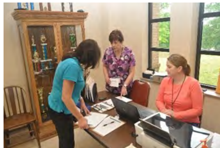
Volunteers at check-in