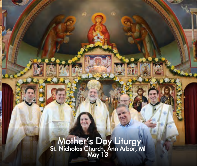
Mother's Day Liturgy St. Nicholas Church, Ann Arbor, MI May 13