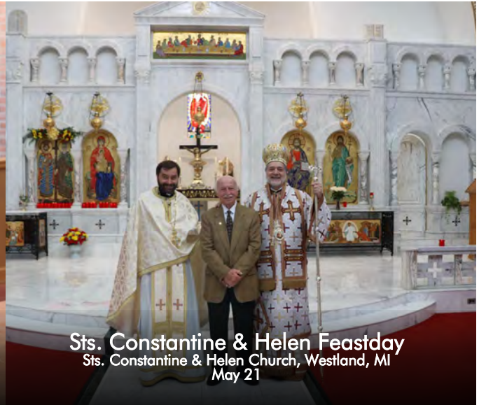
Sts. Constantine & Helen Feastday Sts. Constantine & Helen Church, Westland, MI May 21