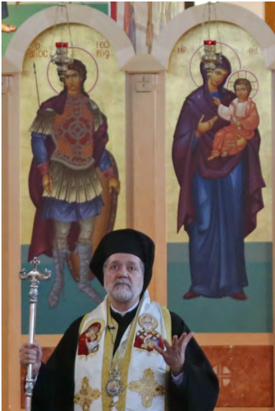
Photo: His Eminence Preaching at the Pentecost Liturgy - St. George Church, Bloomfield Hills, MI

When we consider how we live our lives, I think it is fair to say that we usually find ourselves living according to how we were brought up as well as according to how our own personal life experiences have changed us. We receive something from our homes and something from the world in which we live.