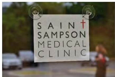
Sign at door welcoming patients