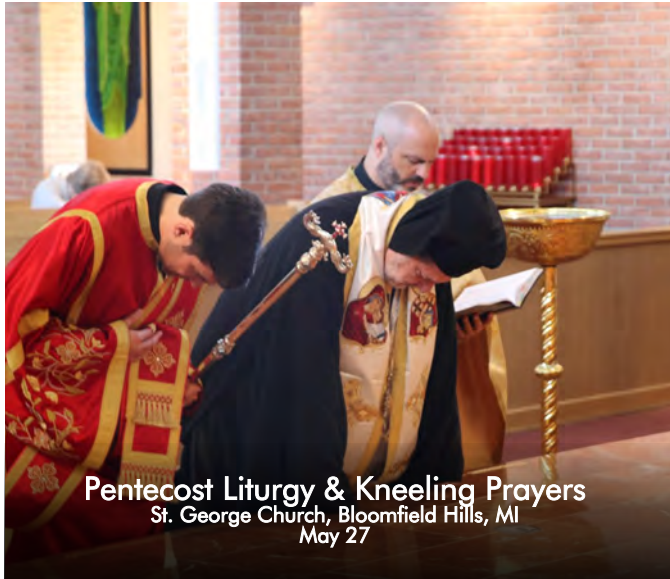
Pentecost Liturgy & Kneeling Prayers St. George Church, Bloomfield Hills, MI May 27