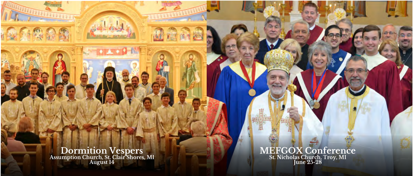
Dormition Vespers Assumption Church, St. Clair Shores, MI August 14