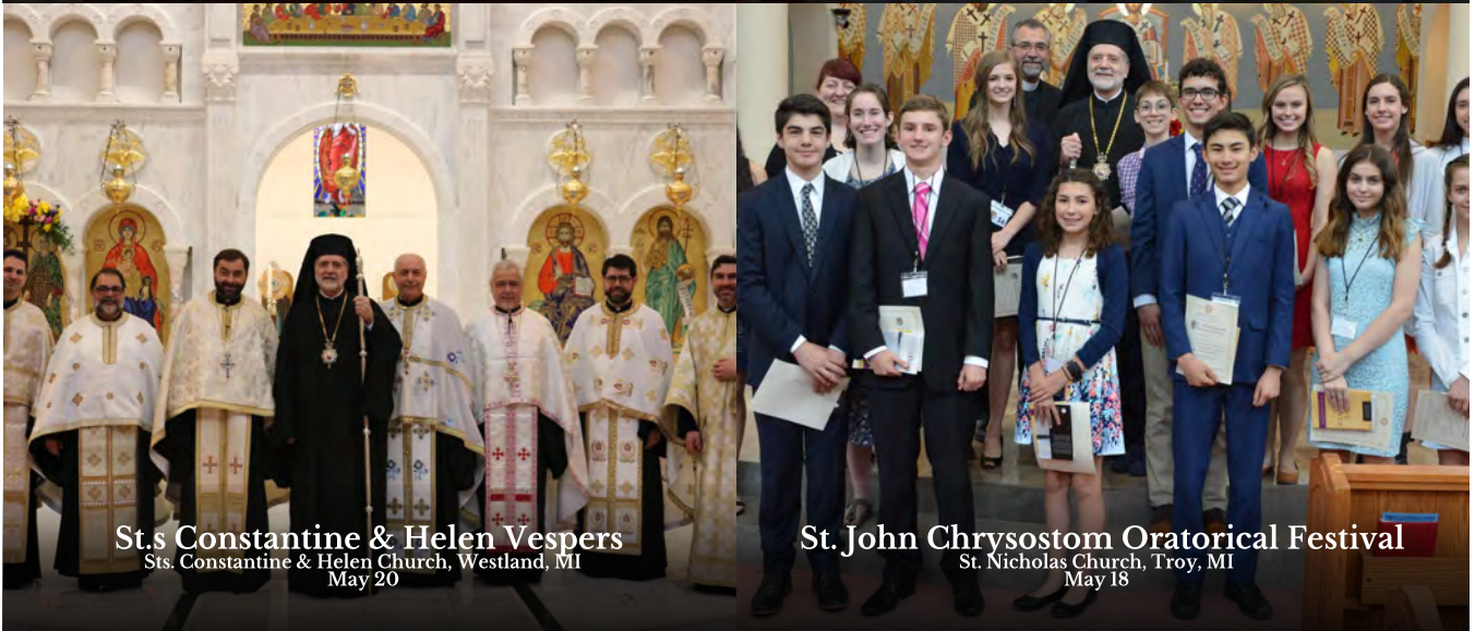
St.s Constantine & Helen Vespers Sts. Constantine & Helen Church, Westland, MI May 20