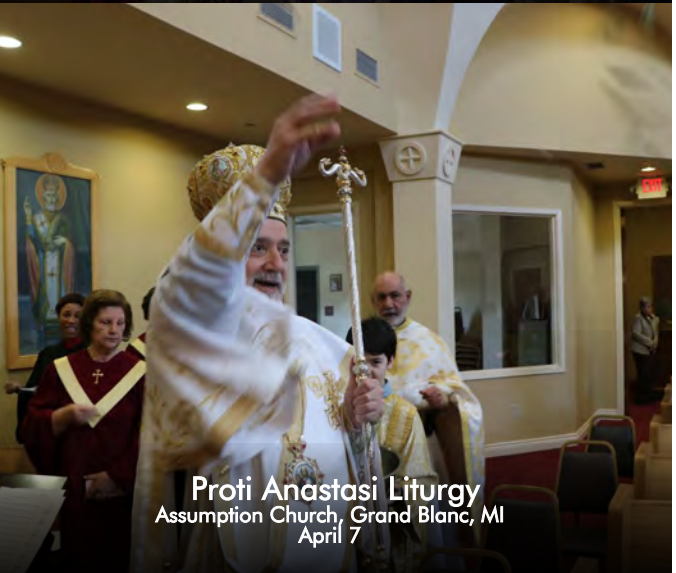
Proti Anastasi Liturgy Assumption Church, Grand Blanc, MI April 7