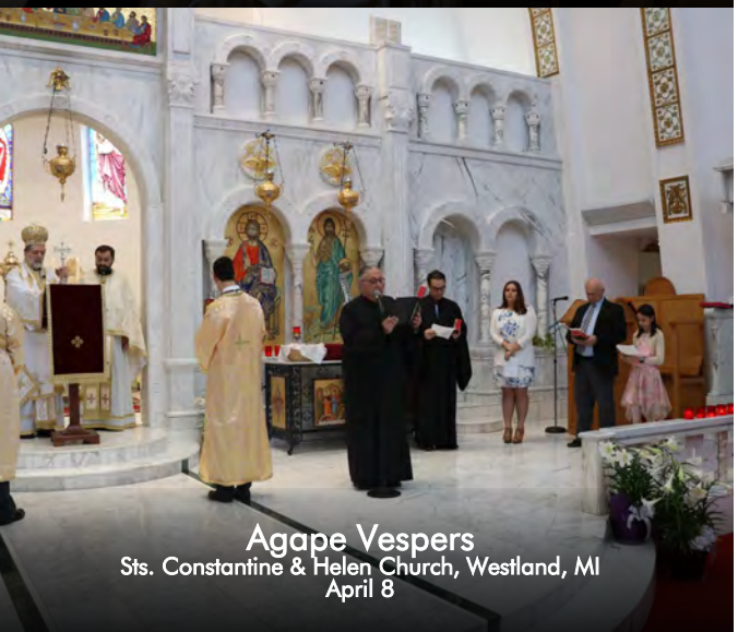
Agape Vespers Sts. Constantine & Helen Church, Westland, MI April 8