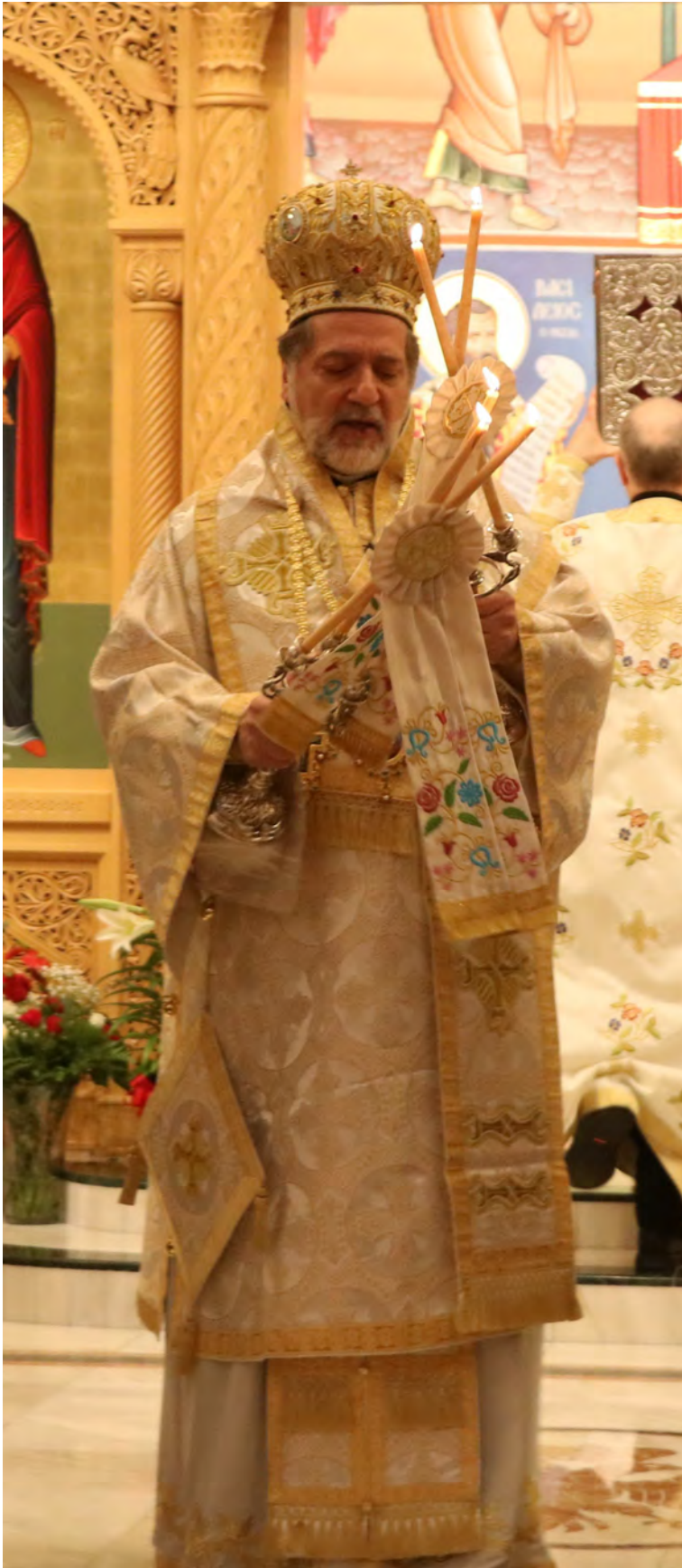
Photo: His Eminence Serves at the Resurrection Liturgy April 8, 2018 | Assumption Church, St. Clair Shores, MI