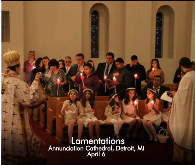
Lamentations Annunciation Cathedral, Detroit, MI April 6