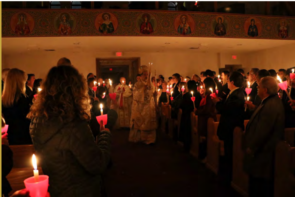
Photo: Paschal Liturgy April 8, 2018 | Assumption Church, St. Clair Shores, MI