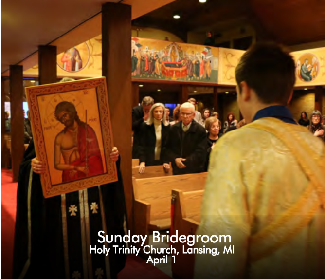
Sunday Bridegroom Holy Trinity Church, Lansing, MI April 1