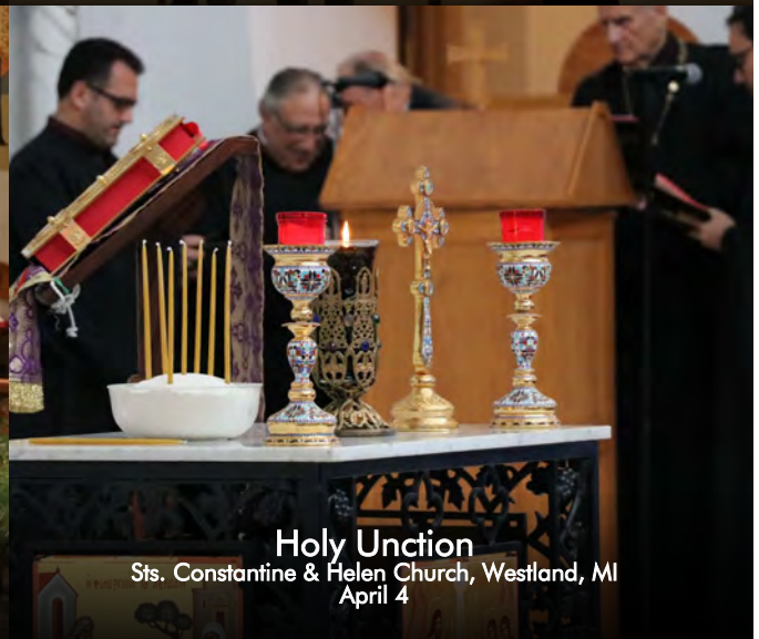
Holy Unction Sts. Constantine & Helen Church, Westland, MI April 4