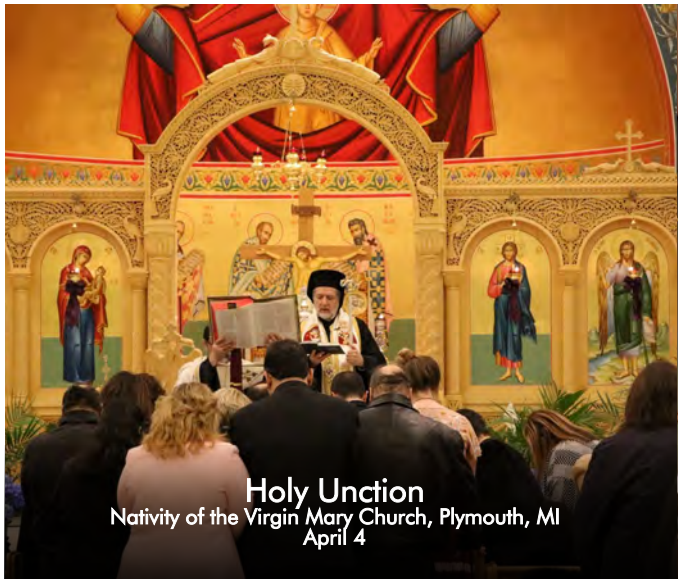
Holy Unction Nativity of the Virgin Mary Church, Plymouth, MI April 4