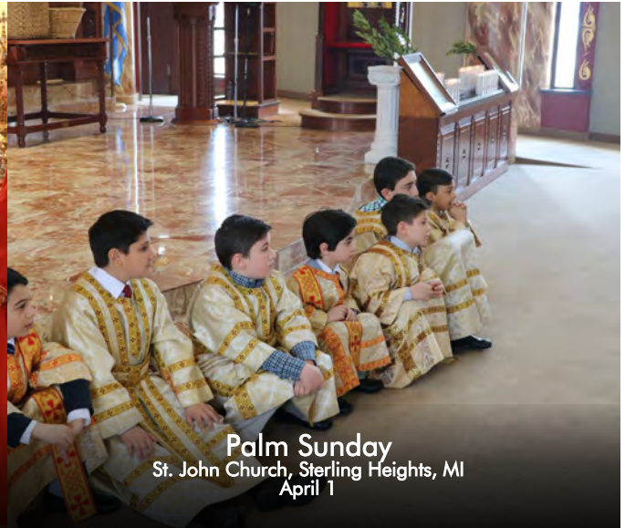
Palm Sunday St. John Church, Sterling Heights, MI April 1