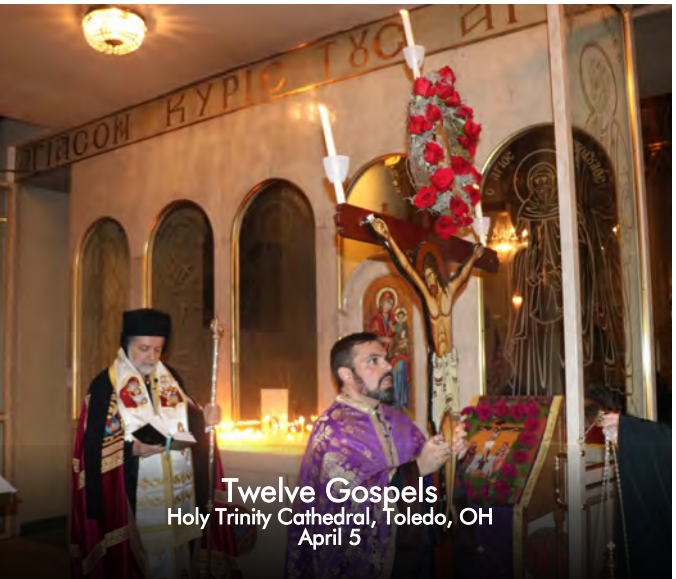
Twelve Gospels Holy Trinity Cathedral, Toledo, OH April 5