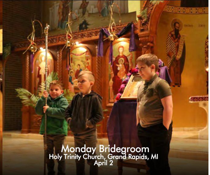
Monday Bridegroom Holy Trinity Church, Grand Rapids, MI April 2