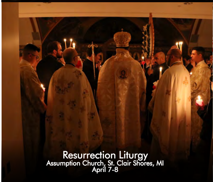
Resurrection Liturgy Assumption Church, St. Clair Shores, MI April 7-8