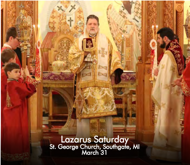
Lazarus Saturday St. George Church, Southgate, MI March 31