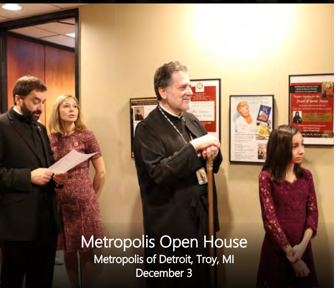
Metropolis Open House Metropolis of Detroit, Troy, MI December 3