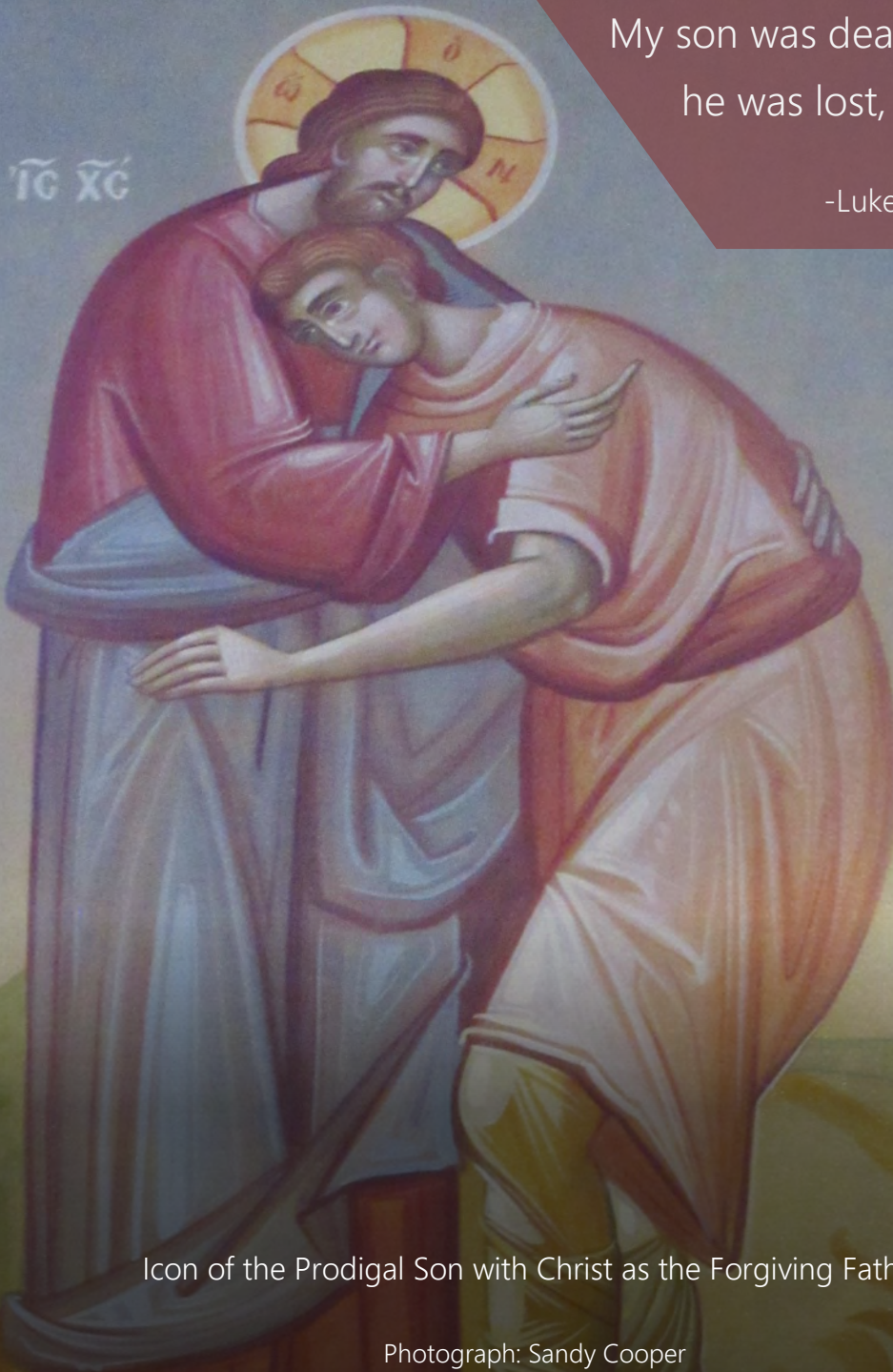
Icon of the Prodigal Son with Christ as the Forgiving Father

Holy Trinity Church, Carmel, IN