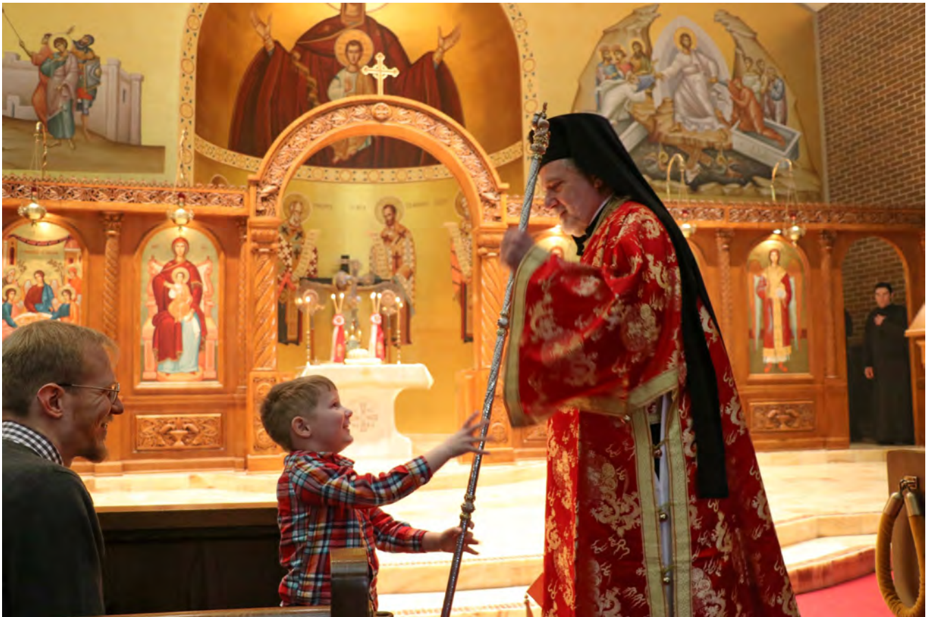
Photo: His Eminence Serves the Divine Liturgy during GOYO Weekend January 28, 2018 | Holy Trinity Church, Grand Rapids, MI