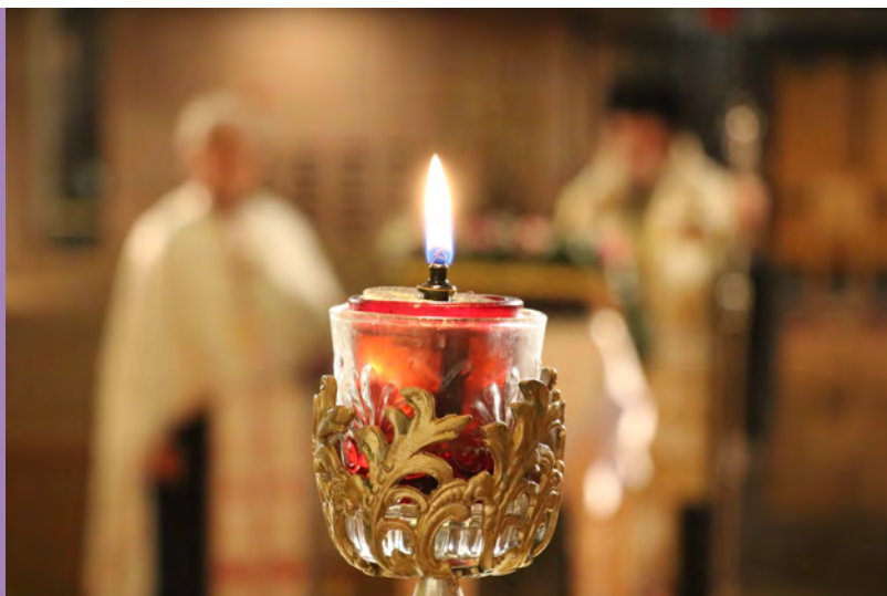
Photo: Akathist Service at St. George Church, Bloomfield Hills, MI