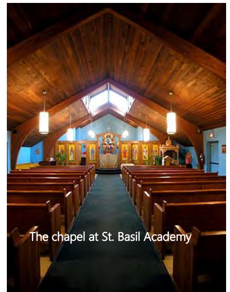
The chapel at St. Basil Academy