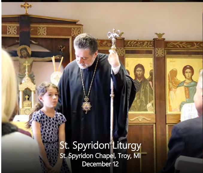
St. Spyridon Liturgy St. Spyridon Chapel, Troy, MI December 12