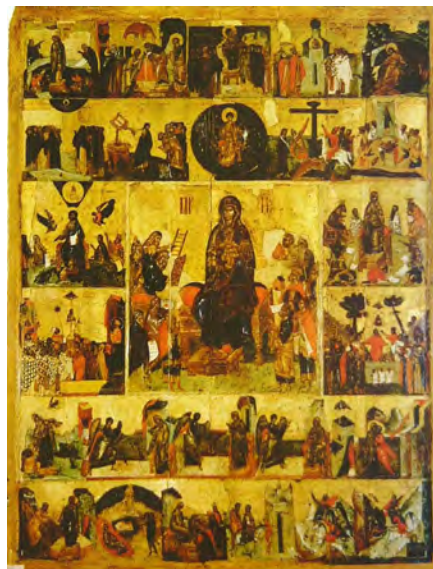
Icon of the Most-Holy Theotokos and Christ, surrounded by scenes from the Akathist. ( http://bit.ly/2DTsLqZ )

We hope this brief explanation of changes to expect in our upcoming services for Great Lent is helpful to understanding the work of church musicians and, most importantly, that your worship experience is enhanced. We wish you a productive and meaningful journey through Great Lent!