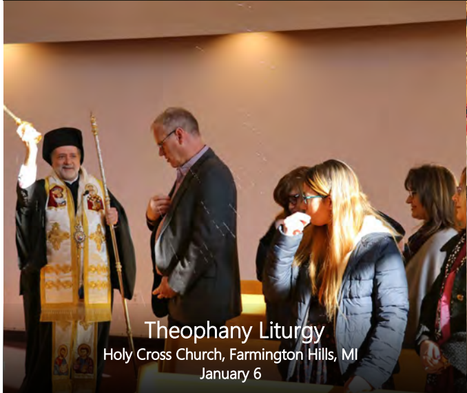
Theophany Liturgy Holy Cross Church, Farmington Hills, MI January 6