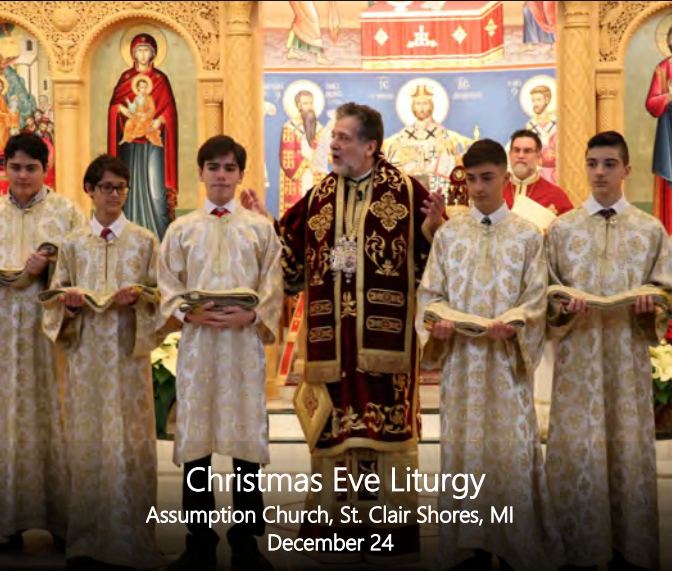
Christmas Eve Liturgy Assumption Church, St. Clair Shores, MI December 24