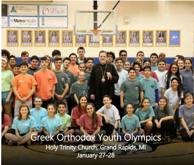
Greek Orthodox Youth Olympics Holy Trinity Church, Grand Rapids, MI January 27-28