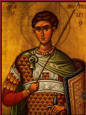
St. Demetrios the Myrrhbearer