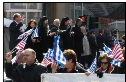
Metropolitan Nicholas and dignitaries greeting the Parade participants.